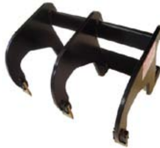
Mini Ripper also available