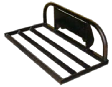
Mini Carryall Leveller also available