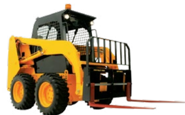
Pallet Forks also available

Contact your local professional dealer or contact Digga direct