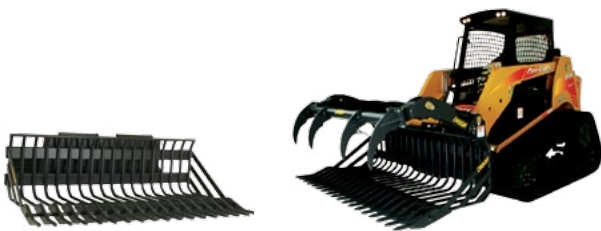
Rock Bucket and Rock Bucket with Grapple also available for Skid Steer Loaders and Tractors