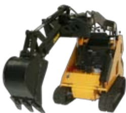
Mini Hoe also available