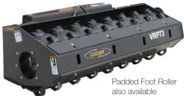
Padded Foot Roller also available