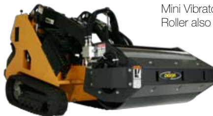
Mini Vibratory Roller also available